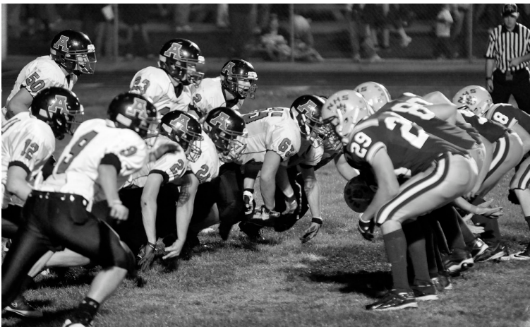
Above: The offensive line is ready to attack Nevada.

Senior pictures are a fun way to document growing up in the world and of course the crazy last year of high school. Seniors need two vertical pictures to Mrs. Spear by December 21st if you want your picture in the yearbook and newspaper! You can drop off two wallets by her room or have your photographer email her a picture.